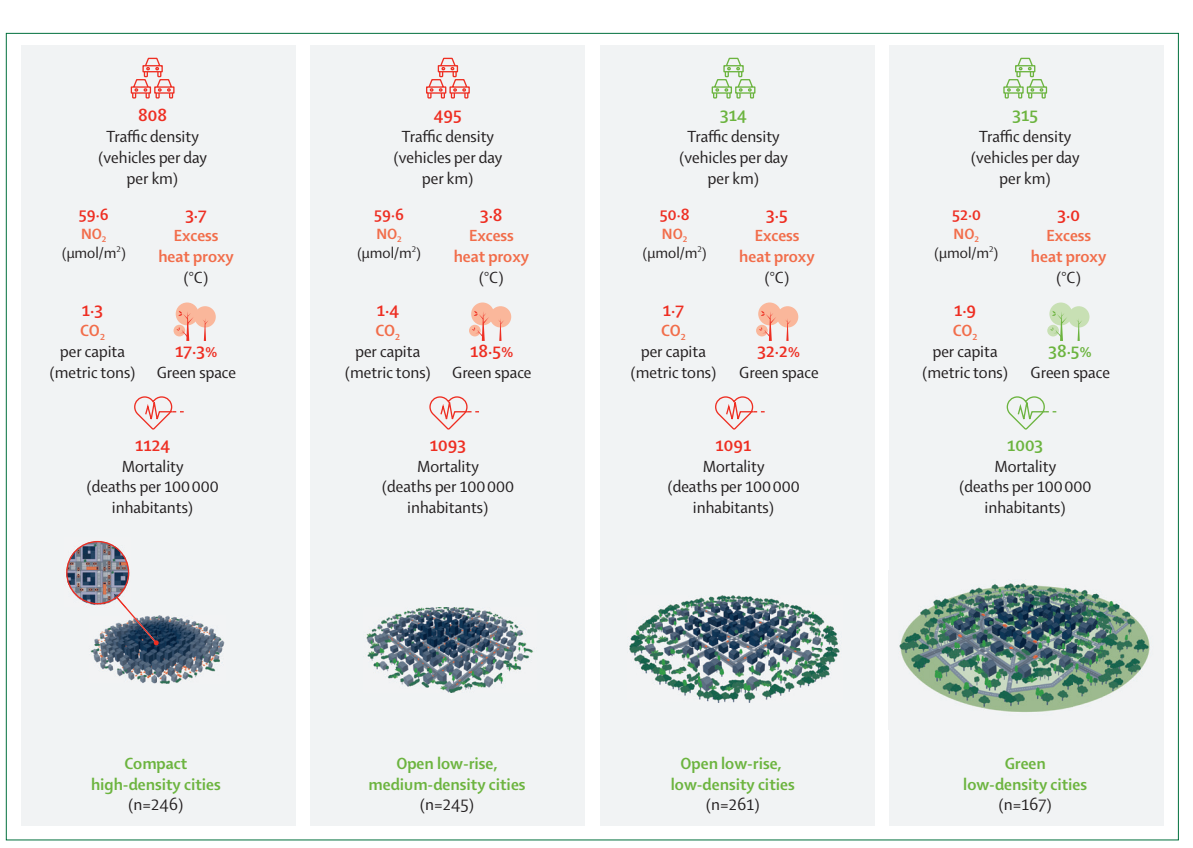
Figure 1: Effects of different city configurations in Europe

NO<sub>2</sub> is an indicator for air pollution. Based on lungman and colleagues (2024).<sup>33</sup>