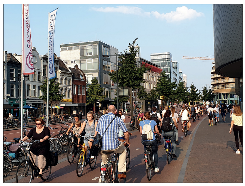
Figure 2: Utrecht, Netherlands, a progressive city that prioritises sustainable and healthy mobility

A better, more health-oriented narrative of climate action might help, particularly if immediate health benefits could be shown. But we also need a more integrated and holistic vision of what our cities should be and should look like to capture the imagination of politicians, decision makers, and citizens and change their behaviour (figure 2). This vision is often still missing. A shift away from our car-centric planning and more greening are essential.